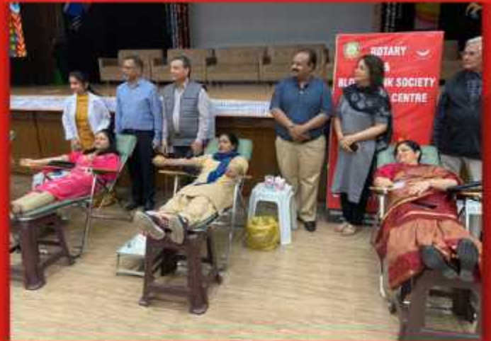
The altruistic donors