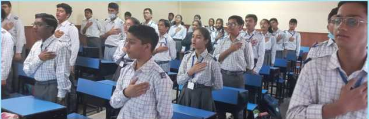
Pledge of unity by all

Sudents of the school come together to commemorate the birth anniversary of "The Iron Man of India" Sardar Vallabhai Patel.