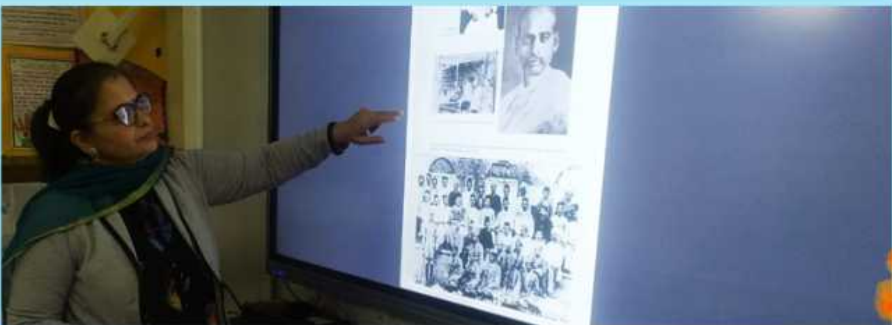
Digital Exhibition 'Sardar Patel — The Architect of Unification'