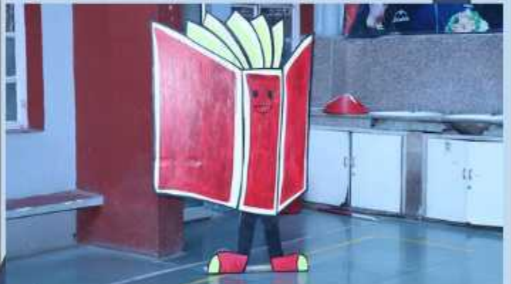
Decorative Art made by students