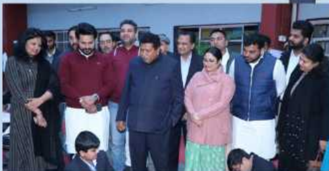
Poster Making being appreciated by the Chief Guest