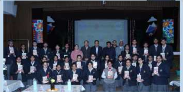
Winners of the Art Competition received book 'Exam Warrior' authored by Sh. Narendra Modi