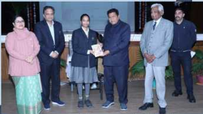
Student being awarded by the Chief Guest