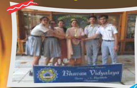
Winners of Existing Start-up Idea Presentation