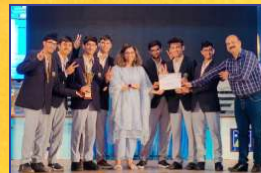
Panchkula Bhavanites shine at Macfair International Competition organised by City Montessori Inter College, Lucknow.