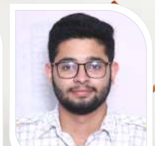
Yash Chahal Medical - 95.8%