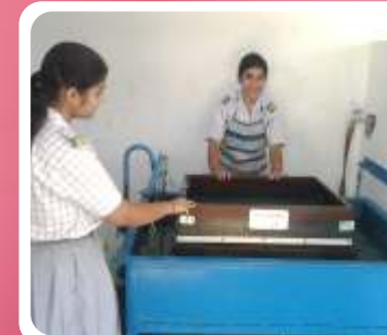
PAPER RECYCLING PLANT