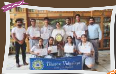
Best Actor Award