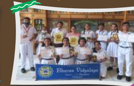
Winners of Geeta Bhashan Pratiyogita