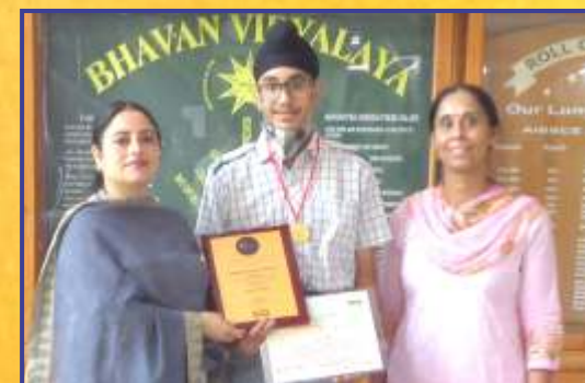
Aseesjot topped the Nation in ACER- IBT test for Mathematics.