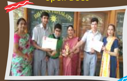
Winners of Social Science Quiz