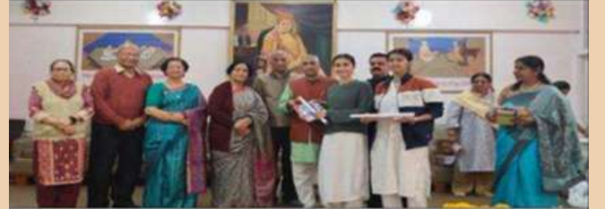
Mantra Ucharan Pratiyogita