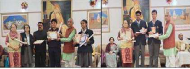
Dharam Shiksha Pariksha Pratiyogita