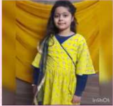
A balletic dance performance by vrinda