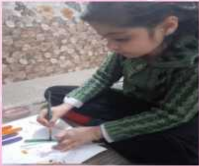
Popsicle art by Vrinda Chhabra