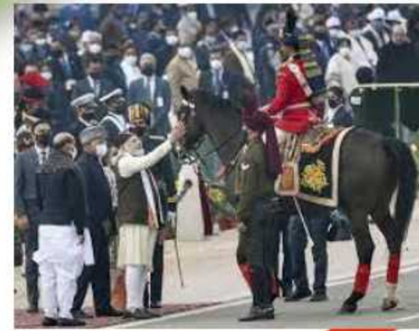
VIRAT, ELITE HORSE OF PRESIDENT RETIRES ON REPUBLIC DAY