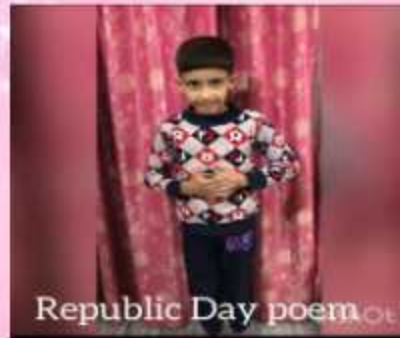
A beautiful poem by Akshat

https://youtube.com/watch?v=DXv0epBhkzw&feature=share