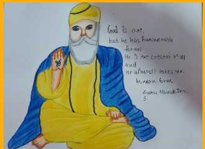
Arushi Saini 9th D